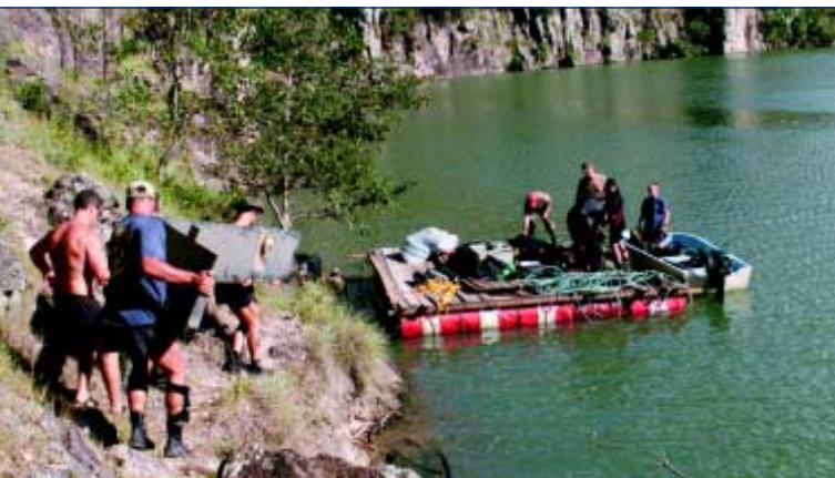
Divers from the Mobile Diving and Salvage Unit 2 detachment, based at Roosevelt Roads, Puerto Rico, prepare for a dive.