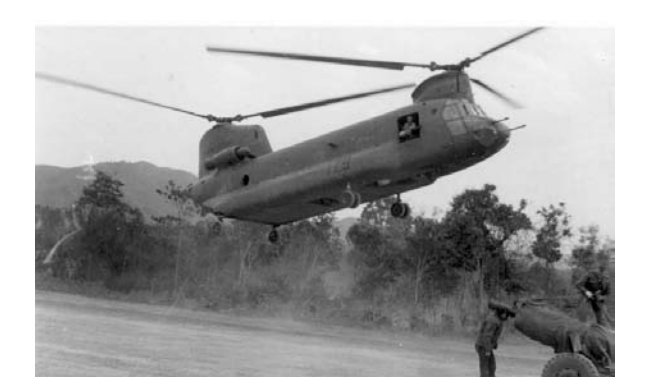
US Army Chinook "179" at Nam Bac in 1967

Before Air America received their own Chinooks in 1972, heavy cargo like guns was transported by US Army Chinooks even within Laos. The photo below, which was taken by MacAlan Thompson at Nam Bac (LS-203) in the spring of 1967, shows US Army Chinook "179" hauling a 105 mm gun up to the top of a nearby hill.