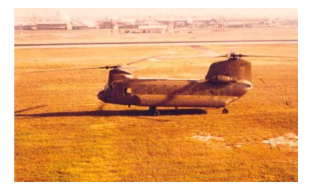
Chinook 857 in 1972/73

Fate: returned to the US Army in June 74 (?); converted to CH-47D in 1990 and reservalled as 90-0184.